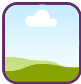
To Be Announced